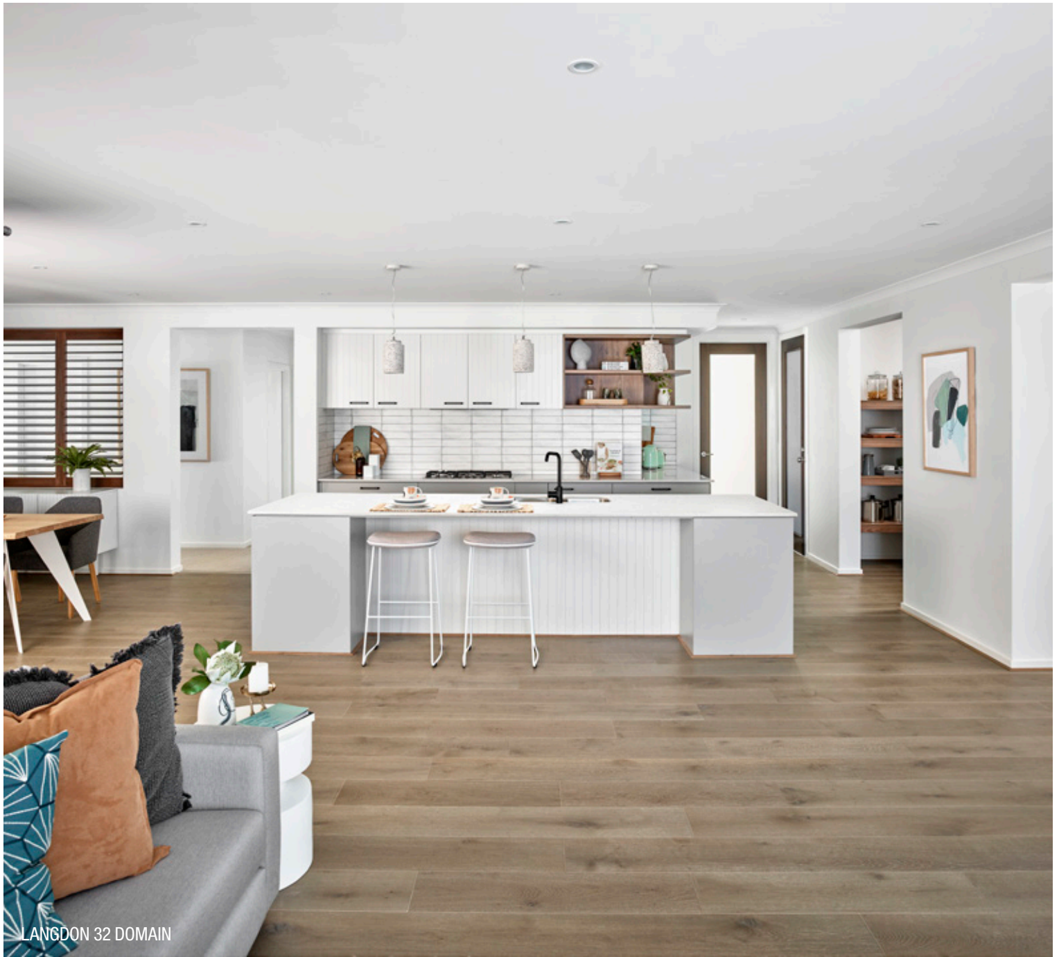
LANGDON 32 DOMAIN