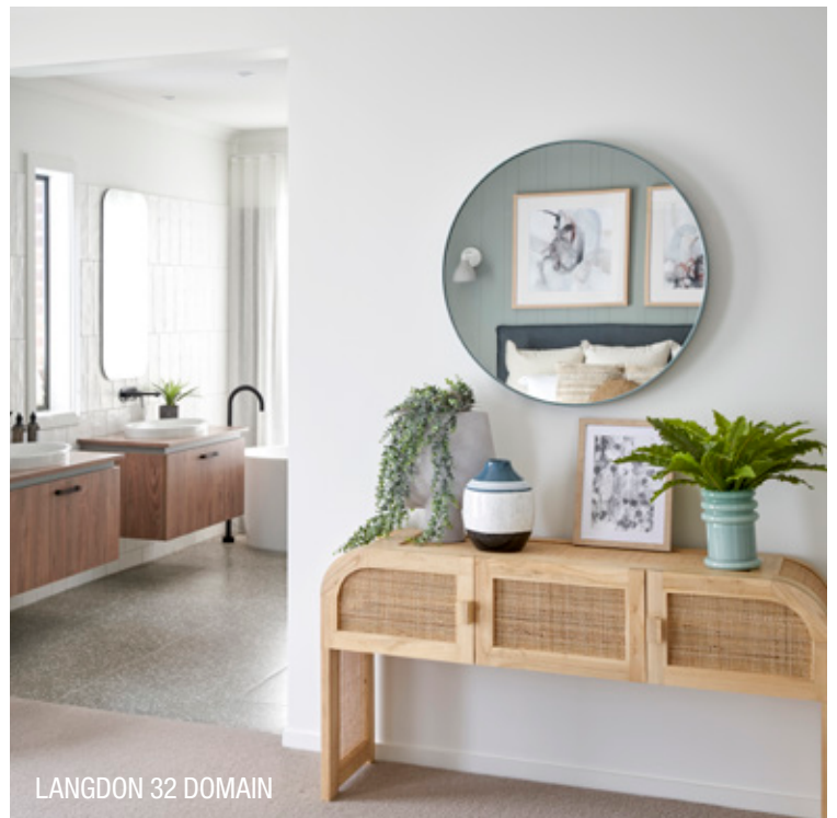
LANGDON 32 DOMAIN