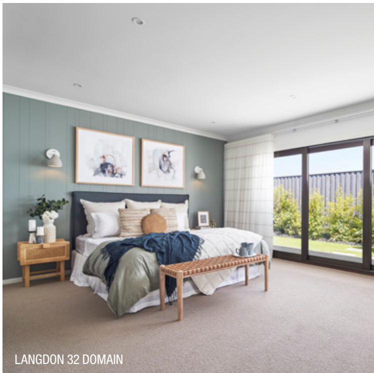
LANGDON 32 DOMAIN