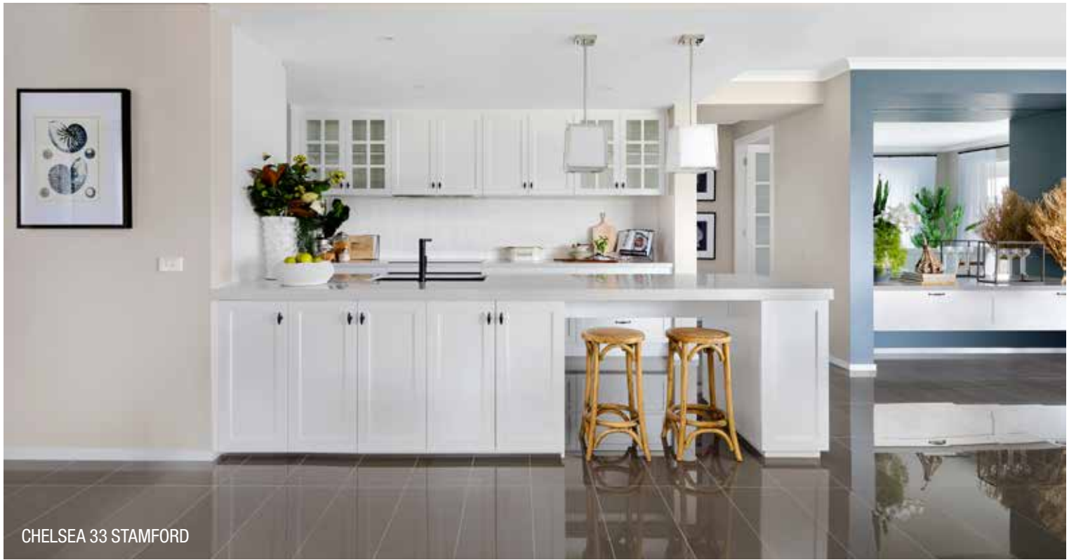
CHELSEA 33 STAMFORD