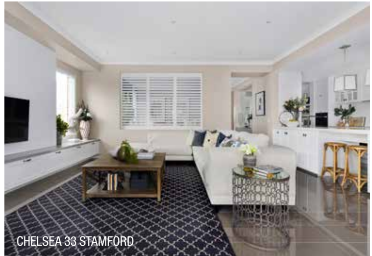
CHELSEA 33 STAMFORD