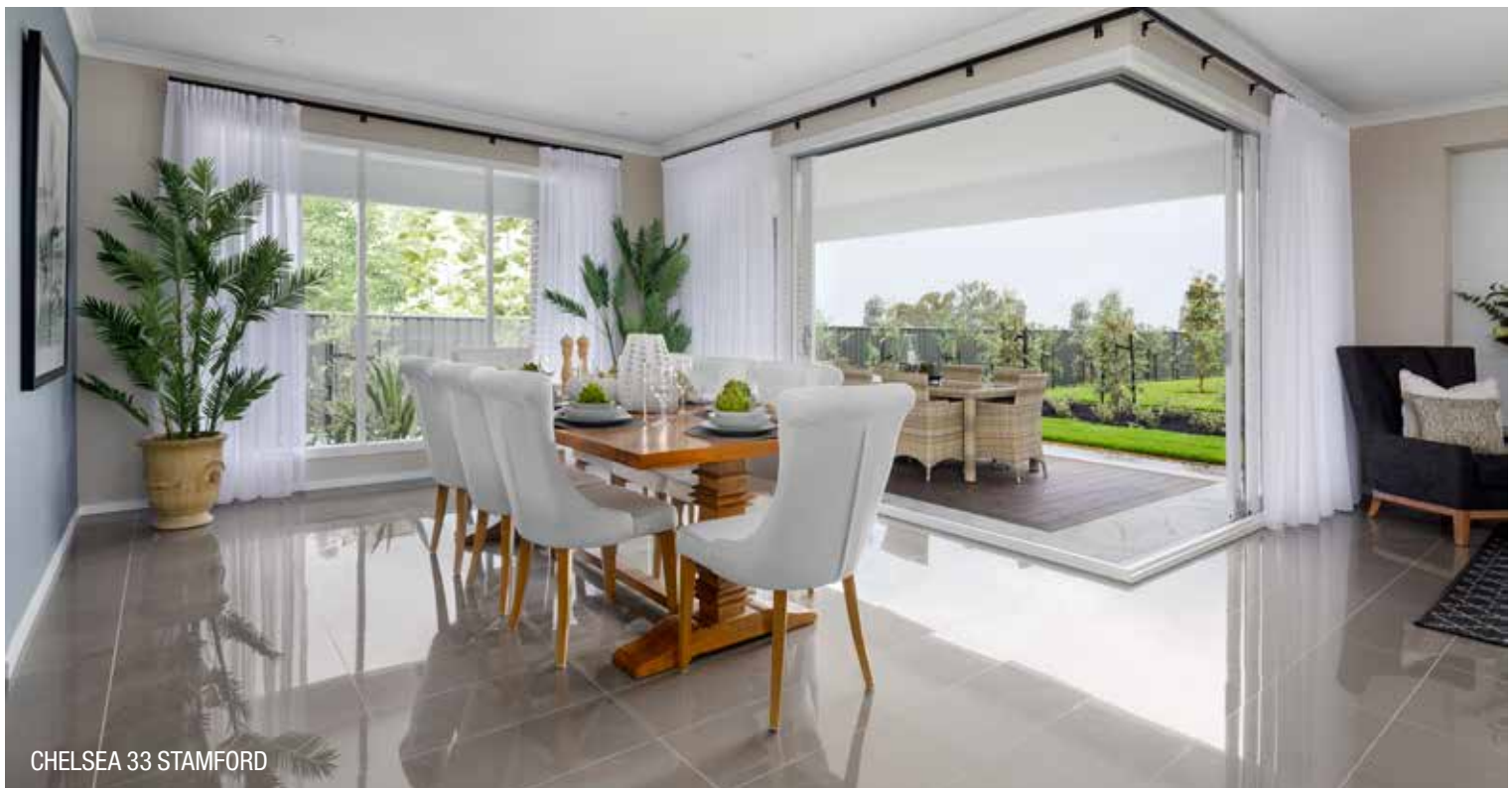
CHELSEA 33 STAMFORD