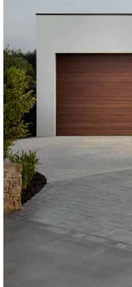
Images depict upgrade items and items not supplied by Metricon namely landscaping, swimming pool, driveway and fencing.