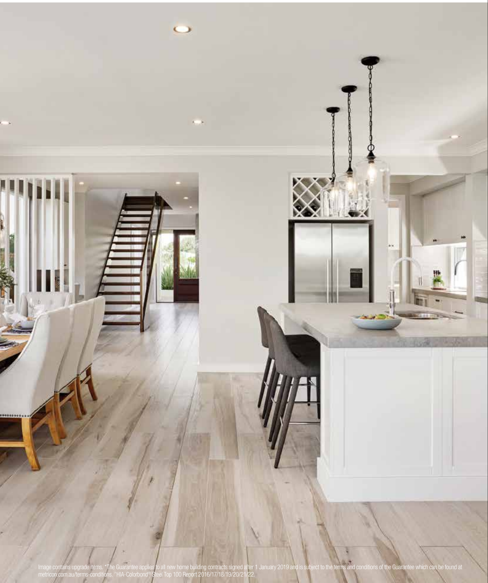
Image contains upgrade items. *The Guarantee applies to all new home building contracts signed after 1 January 2019 and is subject to the terms and conditions of the Guarantee which can be found at metricon.com.au/terms-conditions . ^HIA-Colorbond® Steel Top 100 Report 2016/17/18/19/20/21/22.